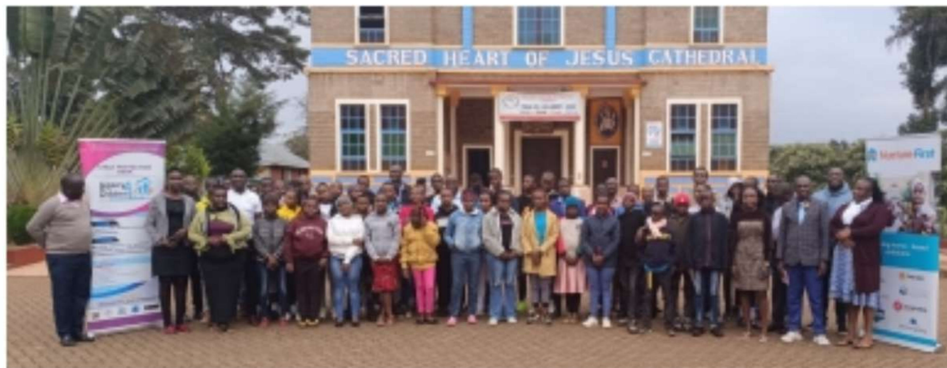
Child participation Forum on 21st August 2024