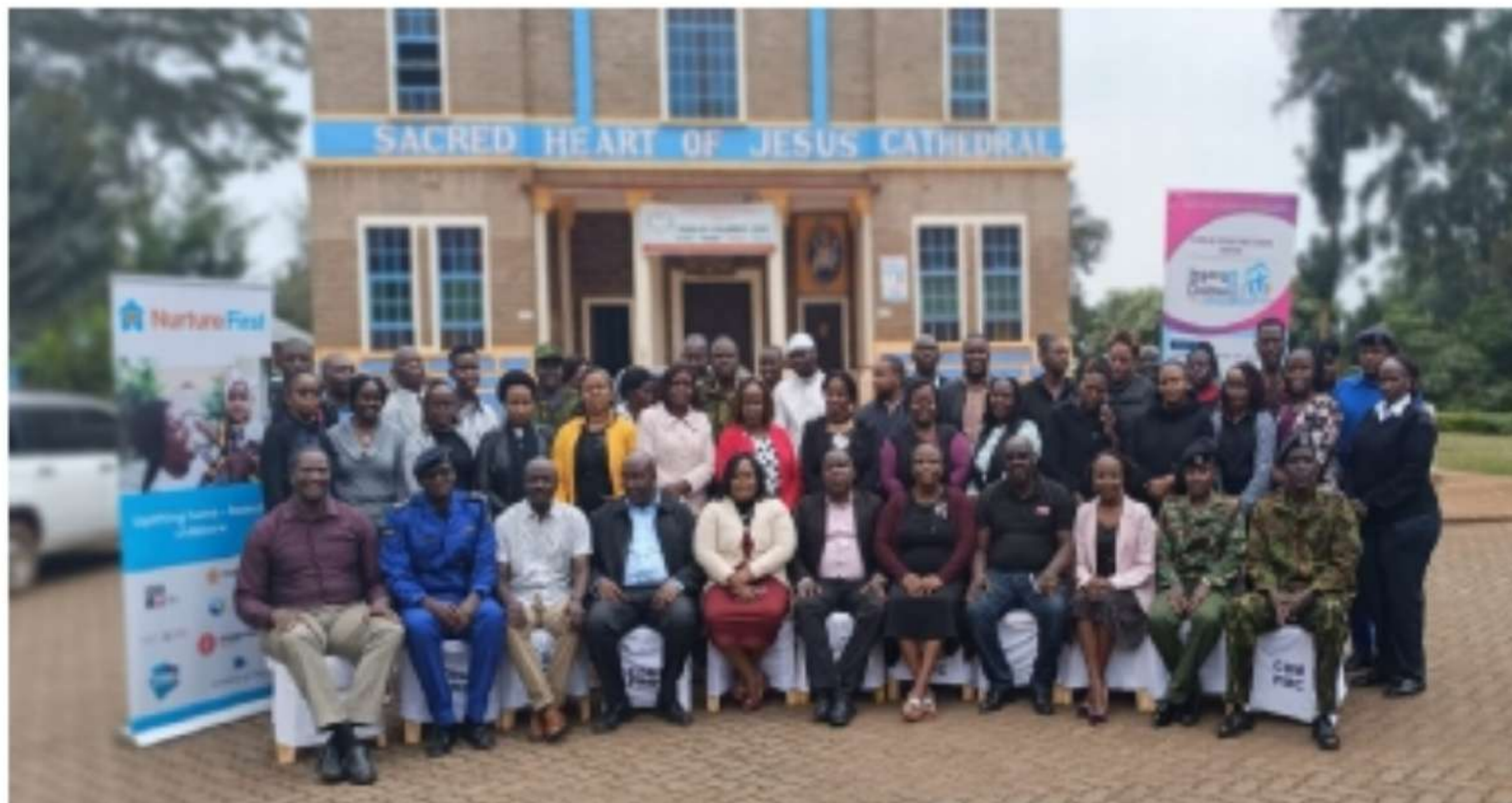
Stakeholders forum on 15th August 2024 bringing together the CUC, CCAC and the National Police Service