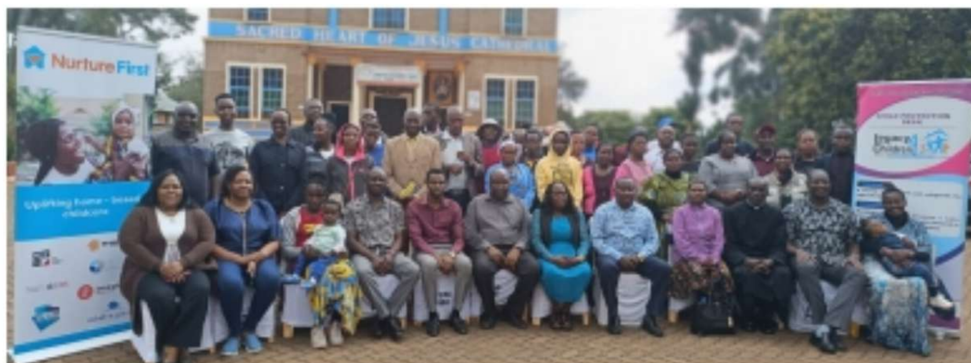
CCLs managers, HBCC services providers and parents during the stakeholders engagements on the draft policy