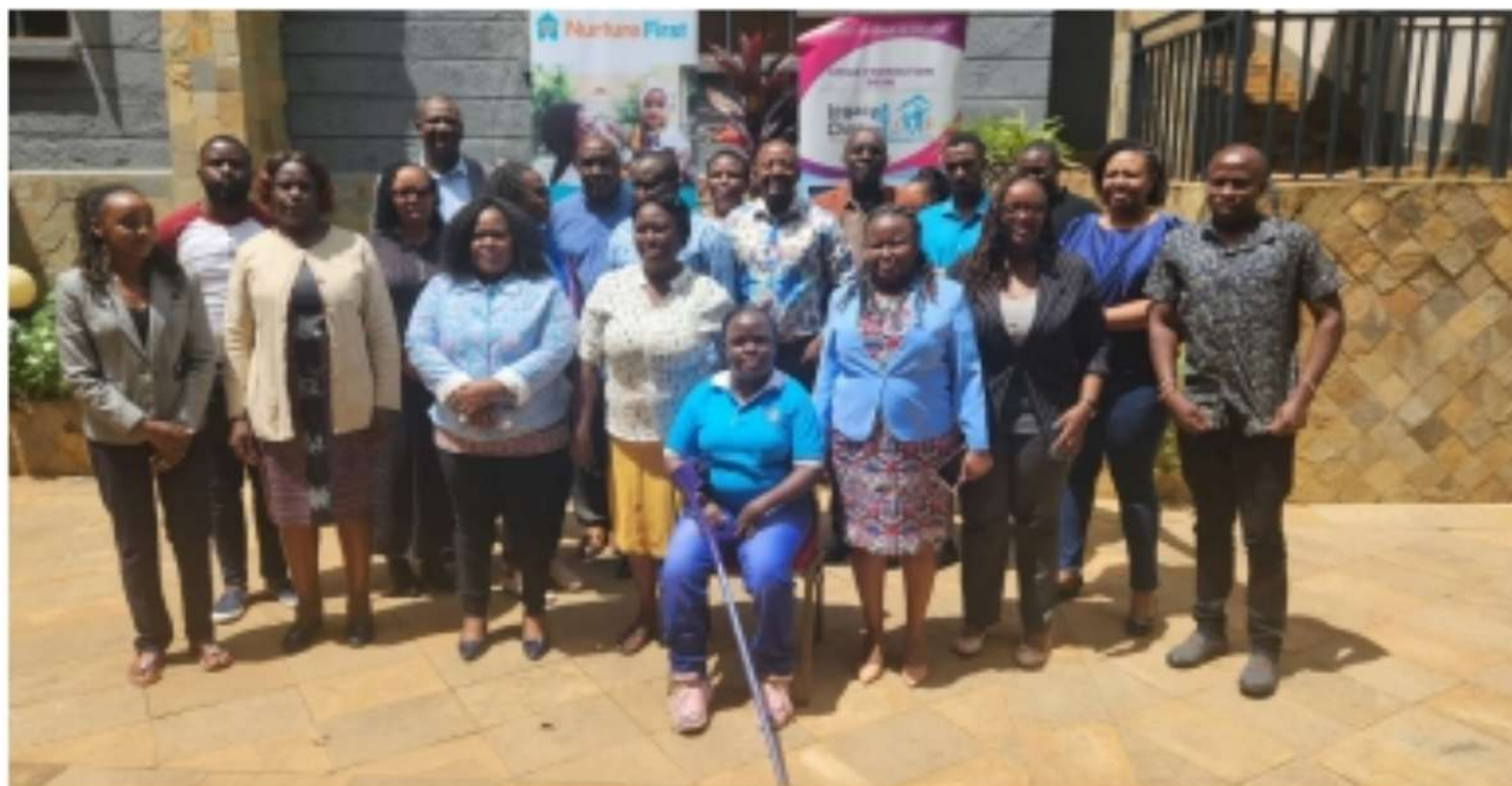
A section of the Technical Working Group during the policy drafting workshop