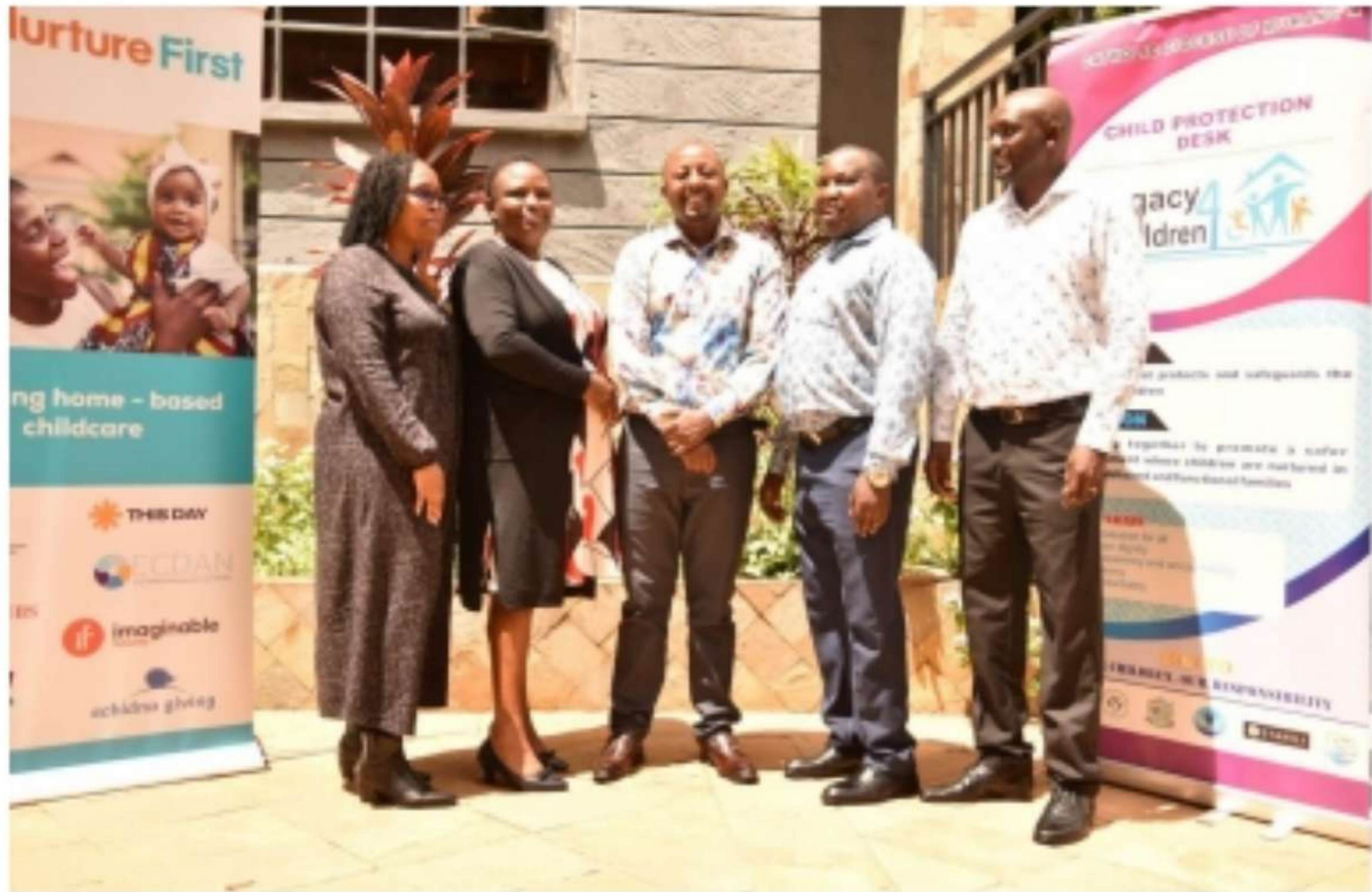
Partners meeting with the County Government on developing the policy framework