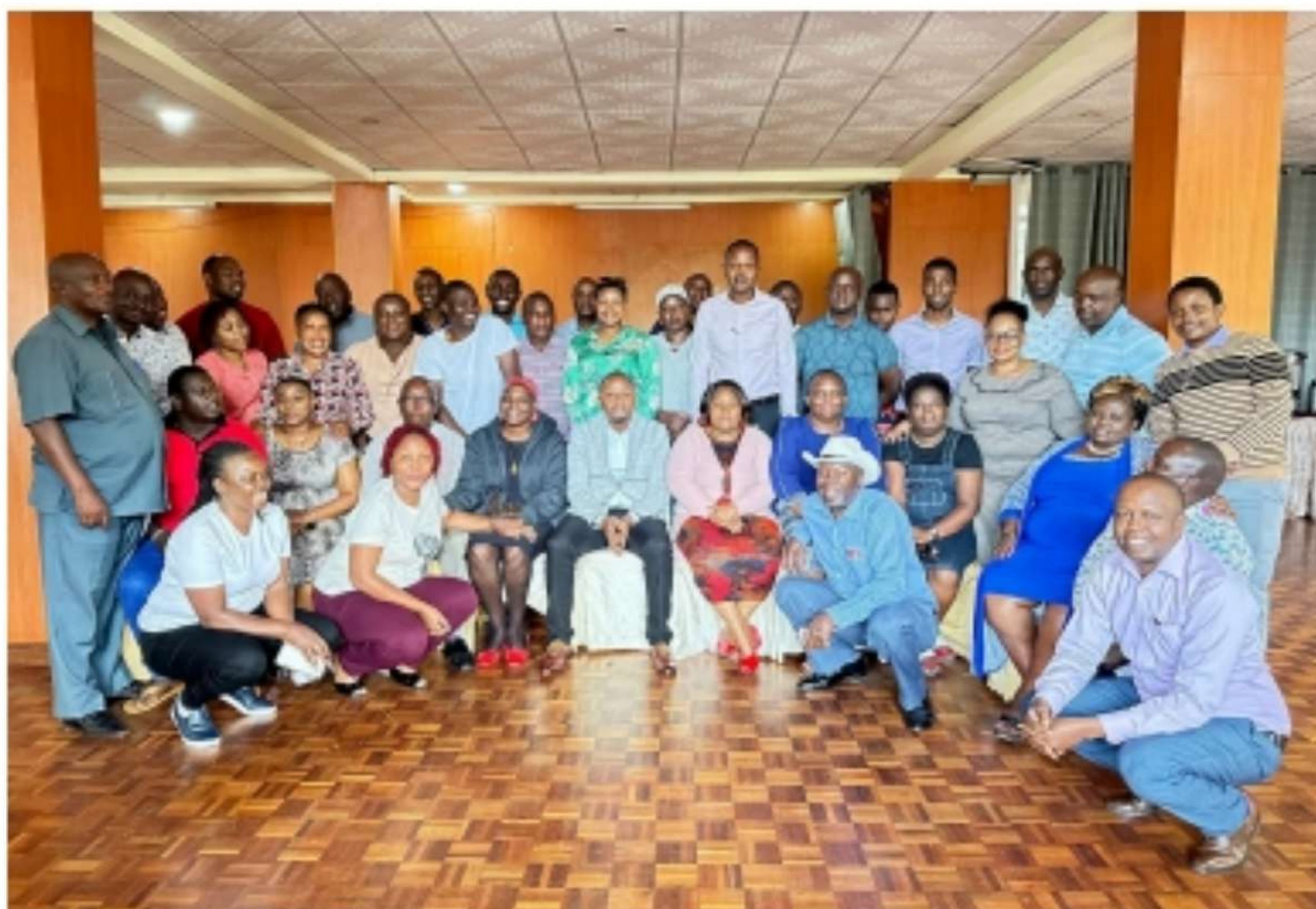
Engagement forum with the Hon. members of the Murang'a County Assembly