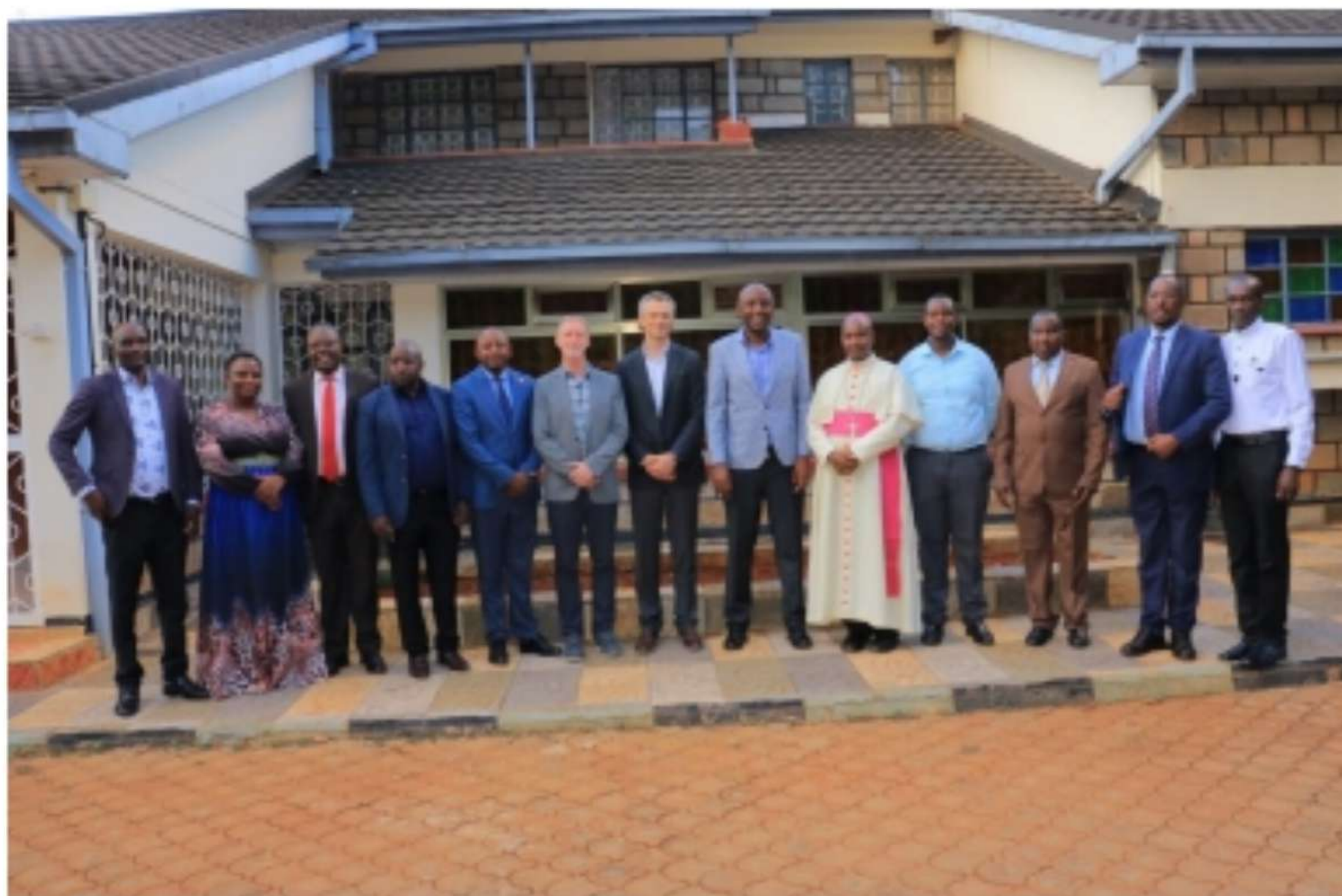
Signing of the MOU between the County Government and the Catholic Diocese of Murang'a on 6th March 2024