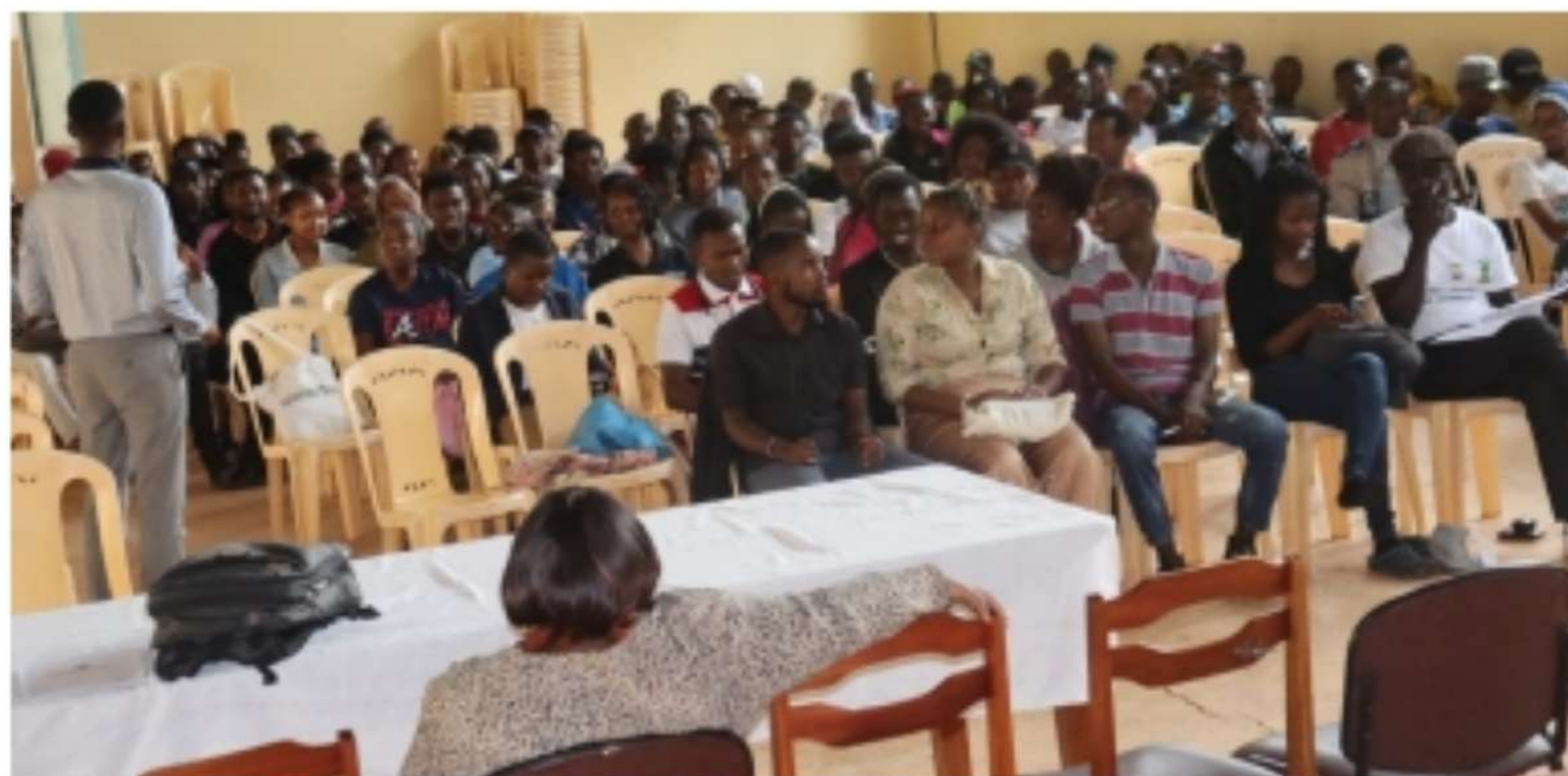
Public participation at Murang'a CDM hall on 13th November 2024